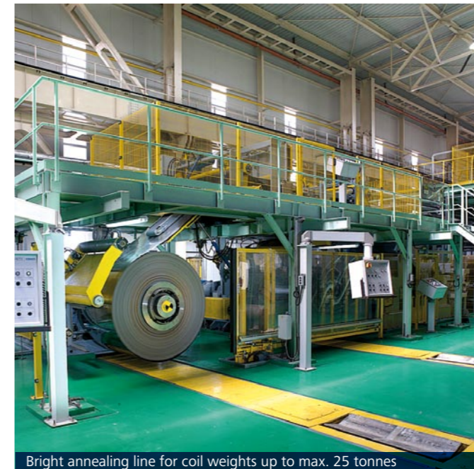
Bright annealing line for coil weights up to max. 25 tonnes