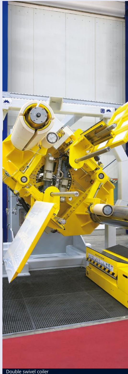
Double swivel coiler